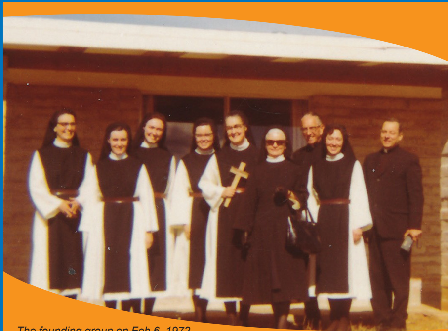
The founding group on Feb 6, 1972