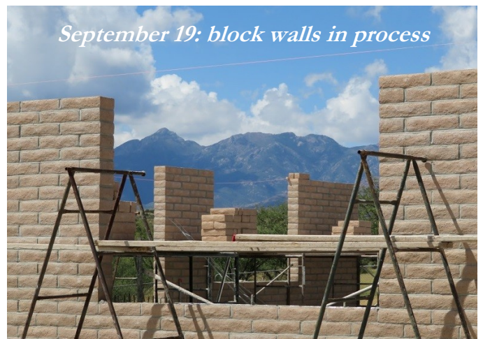
September 19: block walls in process