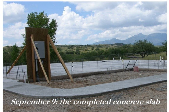
September 9: the completed concrete slab