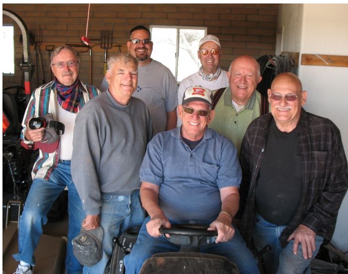
The Knights of Columbus work crew in May.

A new phone system in 2016: This year our Christmas wish is for donations towards replacing our antiquated, expiring telephone system with a new model. Anyone who would like to contribute to the phone system fund may send a donation to Santa Rita Abbey, 14200 E Fish Canyon Rd, Sonoita, AZ 85637-6545. Thank you! May God bless you, all our friends, this Christmas and throughout the New Year with the fullness of His un-failing Mercy and Love!