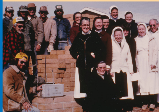
In 1983 a larger church was constructed, and in 1988 the dormitory was enlarged.