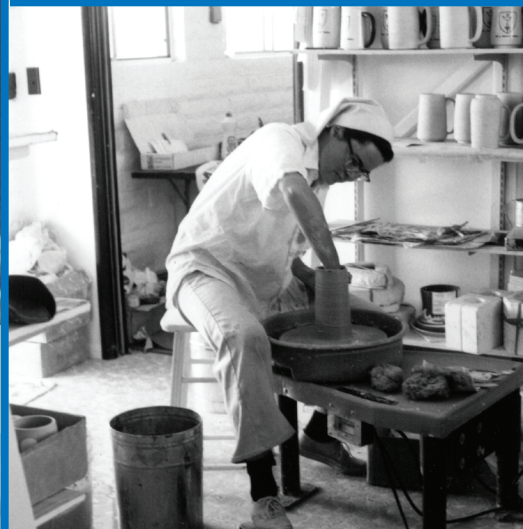
Sr. Beverly crafting ceramics.