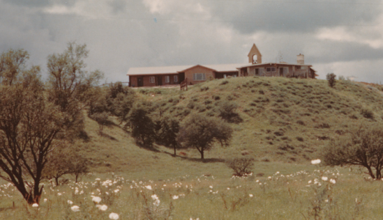
The monastery after chapel and dormitory wings were added in 1973.